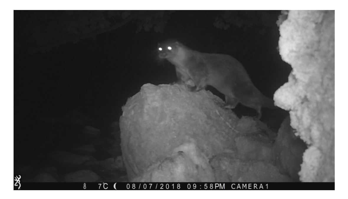
MammalWeb: Understanding wild mammals, one photo at a time

If you're self-isolating and keen on wildlife, <u>MammalWeb</u> could be the perfect solution, no matter your age or knowledge of animals. By improving your ability to spot animals in photos and videos, you'll be helping a national research programme at the same time!