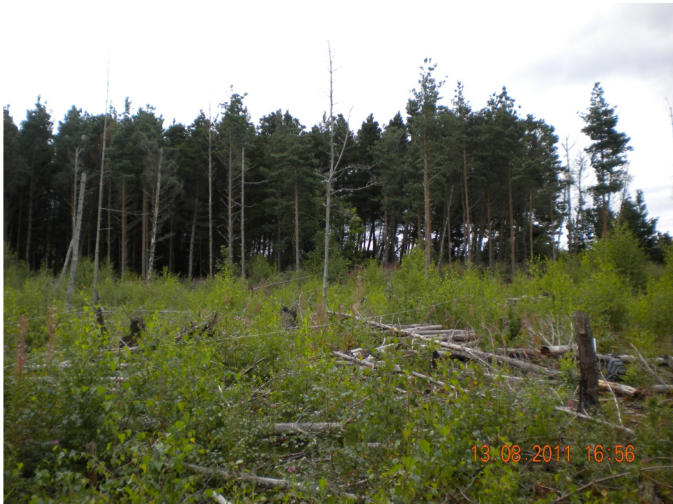
Figure 3 - Birch & willow regeneration in a fire-site in 2011