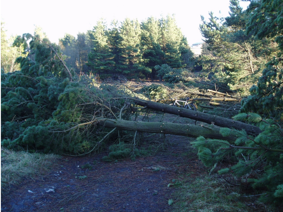
Figure 2 - Windthrown Lodgepole Pines on former New Brancepeth Colliery in January 2002

Although soil was imported to landscape the spoil tips, much of the former colliery and works appear to have been left as flattened rubble, leaving a very thin and poor topsoil. In such conditions coniferous trees are both shallow-rooted and their roots were constrained by their neighbours. Storms in the winter of 2001-2002 flattened many trees, mainly Lodgepole Pines (see Figure 2) and this began the woodland transformation by opening gaps in the canopy to admit light and other plant species. Windthrow continues to knock down some trees each year, but not in such numbers as 2001-2002. Many small fires have been started deliberately or accidentally over the years, but around 2006 there were 2 or 3 large fires that destroyed or killed several hectares of pines. In these fire-sites, birch, willow, and pine are regenerating so thickly they are difficult to walk through (see Figure 3). The young trees are now up to 5m. Besides the regeneration of trees, removal of the canopy allowed grasses, rushes, ferns, mosses and a range of herbaceous and woody species to colonise. Although many of the dead trees were cut down, a number of dead pines were left standing, leaving habitat for wood-boring insects, woodpeckers, and so on.