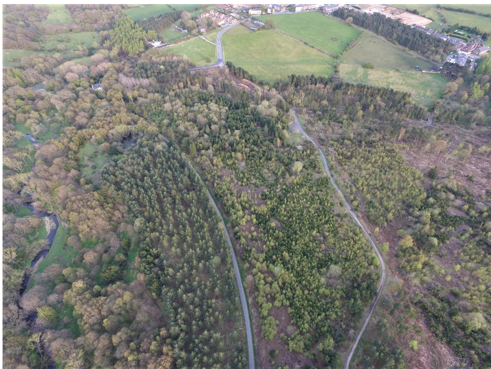
Figure 4 - Deerness Woods in May 2016

Not knowing anything about camera-trapping and only a little about our wild mammals when I started, it has been a very hit-and-miss effort with an undulating learning curve. Two years and three