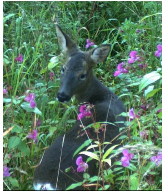
Figure 1 - Doe in Deerness Woods Sept 2015

Back in autumn 2015, thanks to a neighbour who knew of my interest in natural history and who suggested I get in touch with the MammalWeb project team at the University, and after several false starts, I met Pen who loaned a camera to me and explained how to use it. I put it up in a likely location in a willow tree overlooking a pond where there were lots of fresh deer tracks. After 3 weeks I had nothing except selfies from walk-tests in front of the camera. I was tempted to hand the camera back and give up. The camera was several metres up the tree and about 15m from the far edge of the pond where the deer tracks were. Fortunately (or maybe otherwise) I tried moving the camera down to shoulder level and pointing it where it might capture a deer walking by the tree. It did. As soon as I saw the first pictures of a doe and a buck in their new winter coats I was hooked. This article describes some of the camera-trapping in my local woods, and the results, over the last couple of years up to 31 December 2017.