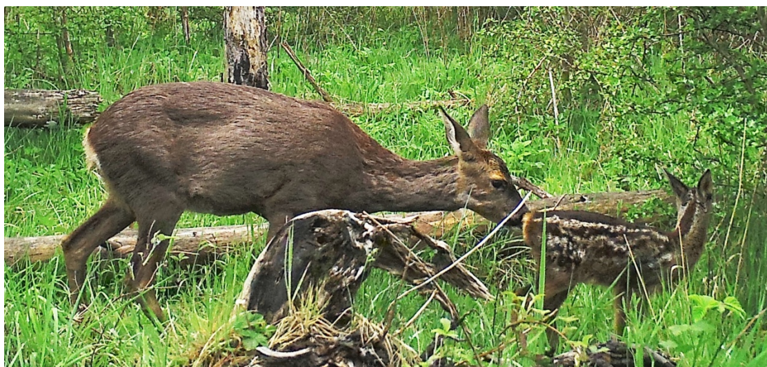
Figure 6 - Doe & fawn in Deerness Woods in May 2016

One might expect a primarily woodland species such as Roe Deer to spend most of their time in woodland, however the three habitats where they appear to spend most of their time, i.e. (1) Clearings and open areas near trees, (2) Edge habitats, (3) Fire-sites, seem to me to offer cover and food in close proximity. I should say that the trees and other woody plants in the fire-sites are now much taller than in the photo in Figure 3. Dog-walkers are among the most frequent visitors to the woods, and some local folk like to shoot, so I think the deer have good reason to need cover. One of the nicest finds was the discovery of a doe with two small fawns last year. How many does give birth each year I'm not sure, but I think it must be several because of the disparate locations in which they turn up at about the same time.